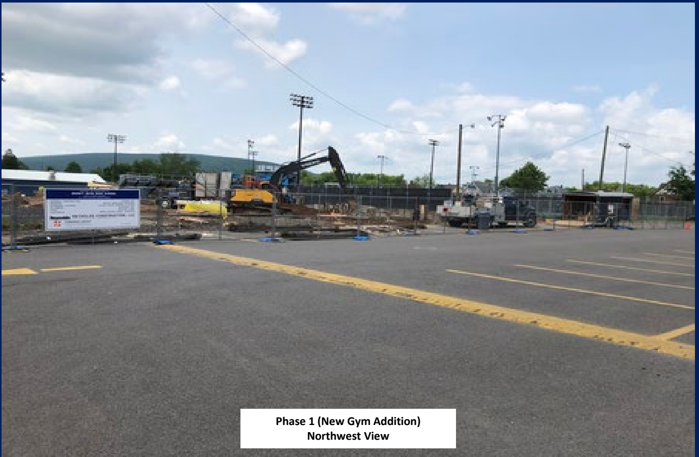
Phase 1 (New Gym Addition) Northwest View